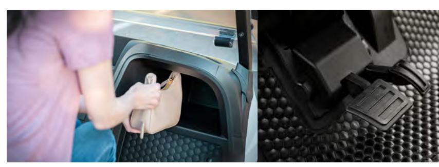
Passenger Glove Box